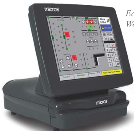
Eclipse PC Workstation

When the server's shift ends, CM is used to close, count, and balance the server bank using automated count sheets. An Over/Under Report can be generated based on a comparison of the actual POS transactions versus the server's physical count of collected tenders.