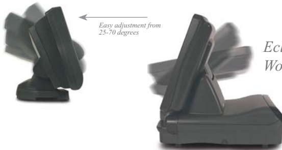
Eclipse PC Workstation

From table service and counter service to bar and cafeteria service, the MICROS 3700 TSR is the only POS system you need. It is scalable enough to support one or all of these operations. A flexible, configurable open application, it adjusts to your operation's processes and needs. Plus, you can put the MICROS 3700 TSR to work anywhere in the world. Multi-language support and multi-currency options, including the EURO, make the MICROS 3700 TSR an international-friendly system. And its country-specific tax features support taxing schemes for all U.S. municipalities and most countries around the world.