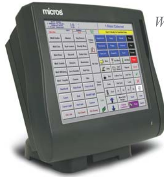
Workstation 4 (WS4)